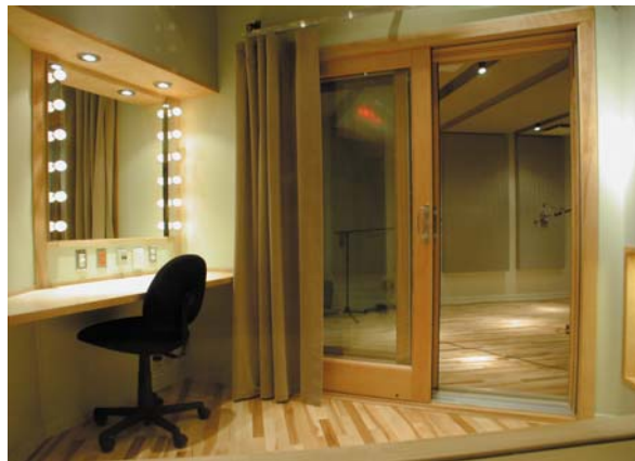
Green Room (Recording Studio and Make-up Room)> < F >