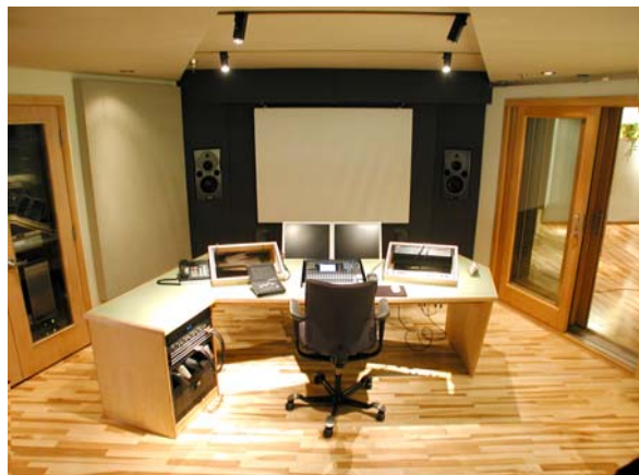
Surround Sound Audio Suite < D >