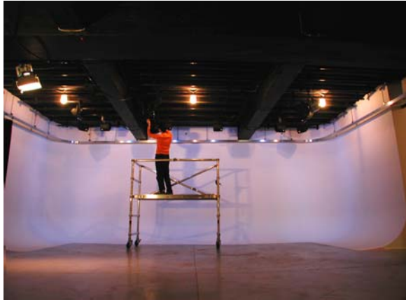
Studio 1, View of the limbo and the lighting grid < A >