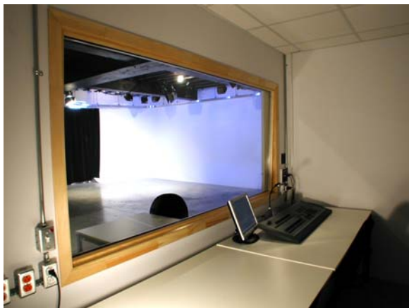
Control room looking into studio 1 < C >