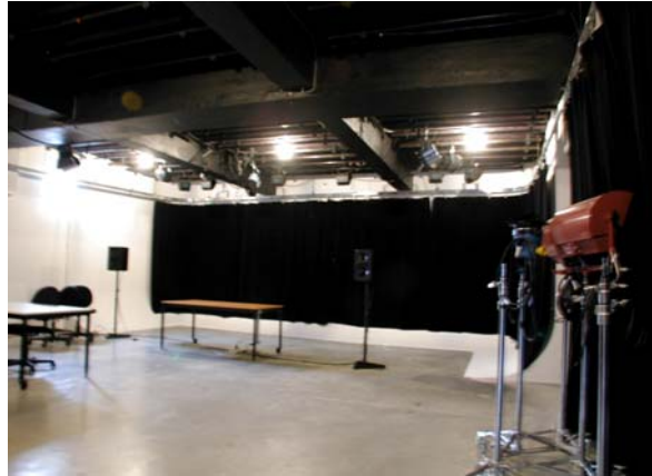
Studio 1, Sliding curtains in front of the limbo> < B >