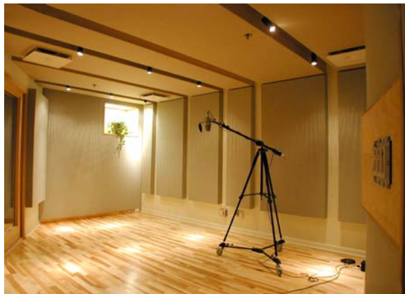
Studio 2 (Recording Studio) < E >