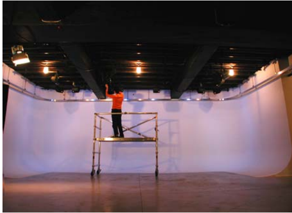
Studio 1, View of the limbo and the lighting grid < A >